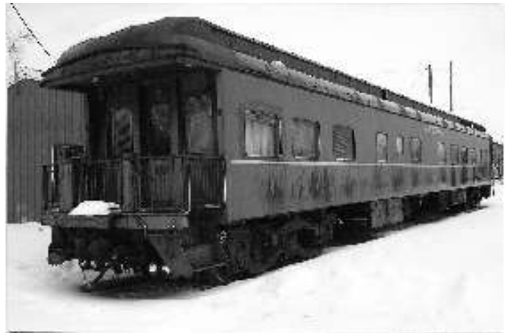
#7 Business car

Sitting quite unassumingly beside or behind the Fright House the former New York Central #7 Business Car has been waiting it's turn to be revitalized. But with a long list of needs and priorities the museum has kept it on the back burner.